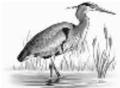
Blackstone National Golf Club

I cannot attend but enclosed is my donation of $ _____