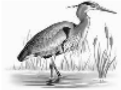
Blackstone National Golf Club